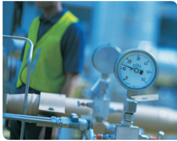
Field Force Automation