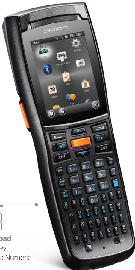
Keypad 57-Key Alpha Numeric