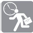
Work Order Tracking