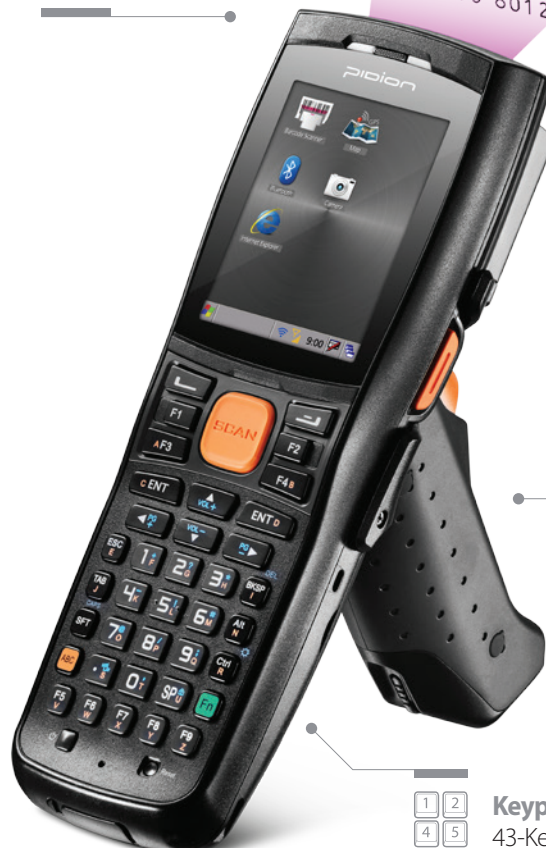
Pistol Grip Kit (optional)